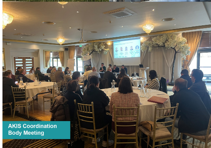
AKIS Coordination Body Meeting